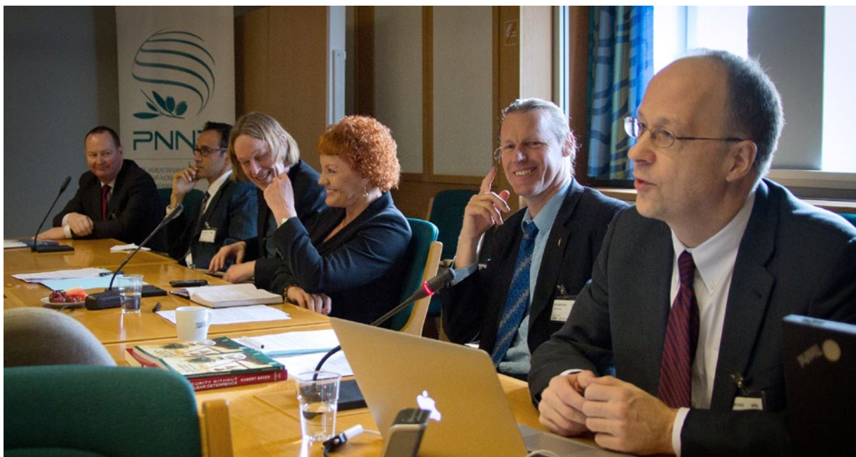
Seminar in the Norwegian Parliament held in conjunction with the 1 st International Conference on the Humanitarian Consequences of Nuclear Weapons .

PNND members have organised a range of actions and events to commemorate the International Day for the Total Elimination of Nuclear Weapons (September 26), including parliamentary debates, motions and joint appeals, social media actions and special screenings of the movie The Man who Saved the World .