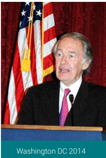
Washington DC 2014

2014: Washington DC, USA. The assembly featured a special event in the historic Kennedy Caucus Room of the U.S. Senate. Karipbek Kuyukov, Honorary Ambassador of the ATOM project, spoke at the event and displayed some of his art. PNND Co-President Senator Markey announced the Smarter Approach to Nuclear Expenditure (SANE) Act which he submitted the following day to the U.S. Senate. The assembly also released an Appeal to the Nuclear Security Summit to commence a similar high level process for nuclear disarmament as they have done for nuclear security.