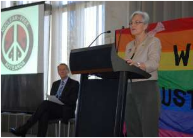
Maryan Street MP (PNND Chair) and Paul Hutchison MP (PNND Deputy Chair) speaking at the New Zealand Parliament Banquet Hall following the unanimous adoption of the parliamentary motion calling on the government to support the Norway Conference on Humanitarian Consequences of Nuclear Weapons

PNND Co-President Marit Nybakk made a special presentation to the PNND Assembly in Astana to publicise the Oslo Conference and encourage support for it from parliamentarians around the world.