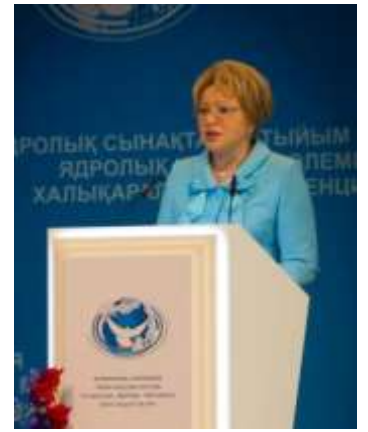
Valentina Matvienko , Chair of the Federal Assembly of the Russian Federation, speaking at the PNND Assembly