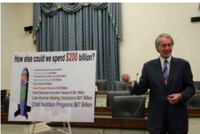
PNND Co-President Ed Markey calling for a reduction in US spending on nuclear weapons

Markey noted, on introducing the SANE Act that “It is insane to spend hundreds of billions on new nuclear bombs and delivery systems to fight a long-past Cold War while ignoring our 21st century security needs and seeking to cut Medicare, Medicaid and social programs that millions of Americans depend on. The SANE Act will cut spending on outdated, wasteful nuclear weapons and related programs over the next ten years and will strengthen our long-term economic and national security.”