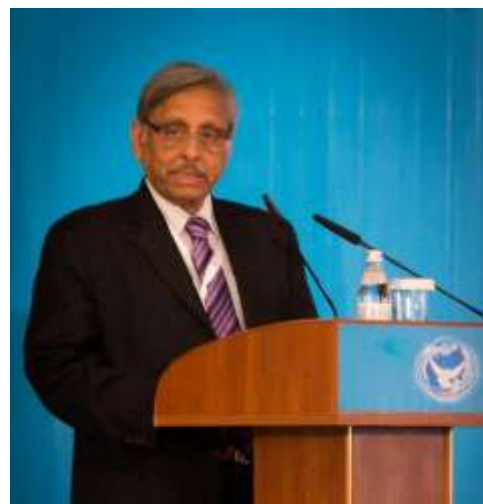
Sri Mani Shankar Aiyar MP addressing the PNND Assembly on the recommendations of the Rajiv Gandhi Action Plan Group established by Indian Prime Minister Manmohan Singh, and which Sri Mani chairs.

In August 2012, Mani Shankar updated participants at the PNND Assembly in Astana on the Action Plan and dialogue that had been taken with the Indian government on its implementation.