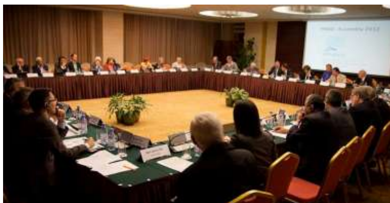
The PNND Council meets following the Assembly in Astana

The Assembly included a high-level opening assembly, a parliamentary conference, the PNND annual Council meeting, a peace concert and a field trip to the Semipalatinsk nuclear test site and Radiation Research Centre (which documents the catastrophic humanitarian consequences of nuclear testing across multiple generations).