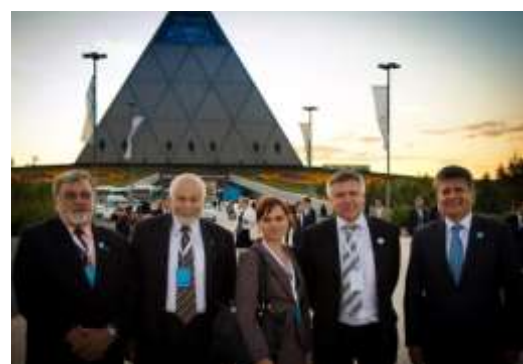
The Czech delegation of parliamentarians to the PNND Assembly outside the Peace Pyramid