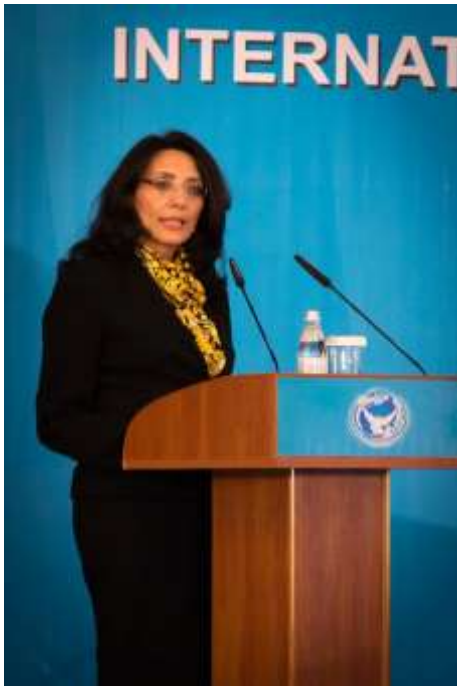
Ambassador Gioconda Ubeda Rivera, Secretary-General of OPANAL, speaking at the PNND Assembly in Astana.

Central Asia. PNND has taken a lead role in building support for these zones and collaboration between them, including as organiser of the Civil Society Forum for Nuclear-Weapon Free-Zones held in conjunction with the 2005 and 2010 Conferences of States Parties to NWFZs.