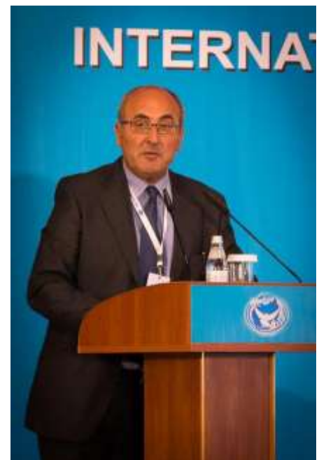
Daniel Ben Simon – Member of the Israeli Parliament and an endorser of the Parliamentary Statement supporting a Middle East NWFZ – speaking at the PNND Assembly in Astana.

At the 2011 Annual Assembly, PNND, opened for signature a Joint Parliamentary Statement for a Middle East Zone Free from Nuclear Weapons and all other Weapons of Mass Destruction , and issued a press release supporting the recent announcement of the facilitator and host country for the 2012 Conference on Establishing a Middle East Zone Free from Nuclear Weapons and all other Weapons of Mass Destruction .