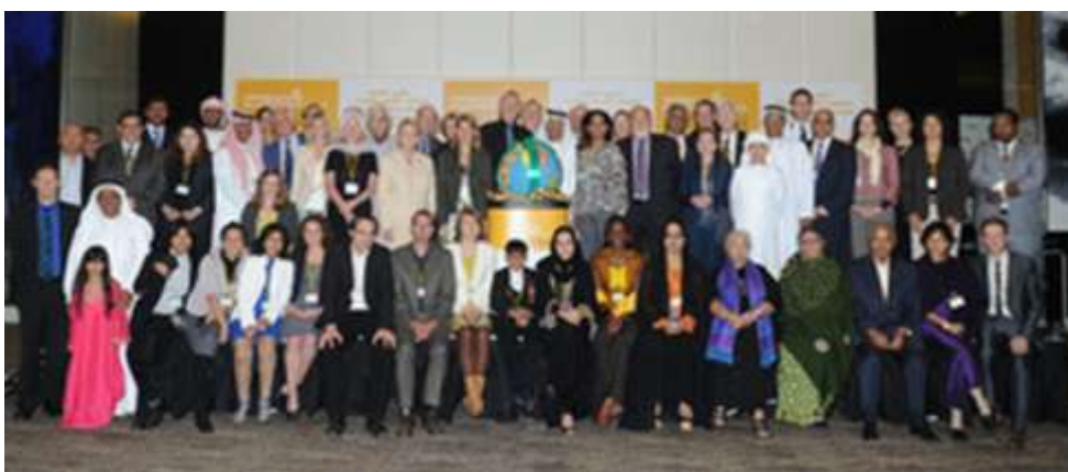
World Future Council meets in Abu Dhabi, 24-27 November. Key topics included engaging parliamentarians in the Climate-Nuclear Nexus (in collaboration with PNND), food security, disarmament for development, humanitarian consequences of nuclear weapons and promoting renewable energies.

The specific links between climate change in the Arctic region and the risks of increased military conflict including between nuclear-armed powers, is a driving factor behind the increased activity of PNND and partner organisation Pugwash on the proposal for an Arctic Nuclear Weapons Free Zone.