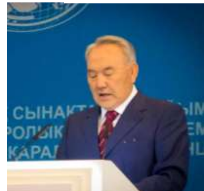
Kazakhstan President Nursultan Nazarbayev opens the PNND Assembly