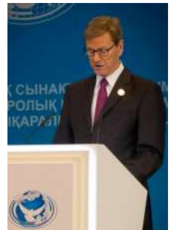
German Foreign Minister Guido Westerwelle addresses the PNND Assembly in Astana

PNND was commissioned by the Inter Parliamentary Union to draft a Handbook for Parliamentarians on Nuclear Nonproliferation and Disarmament . PNND formed an experts advisory board for the project (which included representatives of the CTBTO, ICRC, UN Office of Disarmament Affairs, European and Asian/Pacific Leadership Networks for Nuclear Nonproliferation and Disarmament, leading parliamentarians and key analysts), engaged a wide range of parliamentarians in the consulting process and, with the agreement of IPU, produced a book with considerably more depth and breadth than at first envisaged.