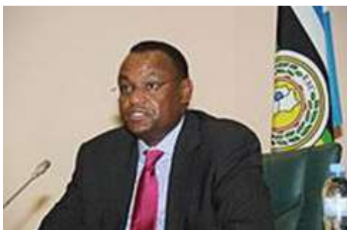
Abdirahin Abdi, Speaker of the East African Legislative Assembly, presenting to the Conference of Parliamentarians of Countries Most Vulnerable to Climate Change

Climate change is one of the most pressing issues for governments, parliaments and civil society today. In fact the environmental and economic impact of climate change – and risks of even greater impact in the future – have shifted the spotlight of political attention away from other major risks – particularly the risks from nuclear weapons. A growing awareness of the similarities and links between climate change and nuclear-weapons risks can revive badly needed political attention to the nuclear weapons issue. As such, PNND advances these links.