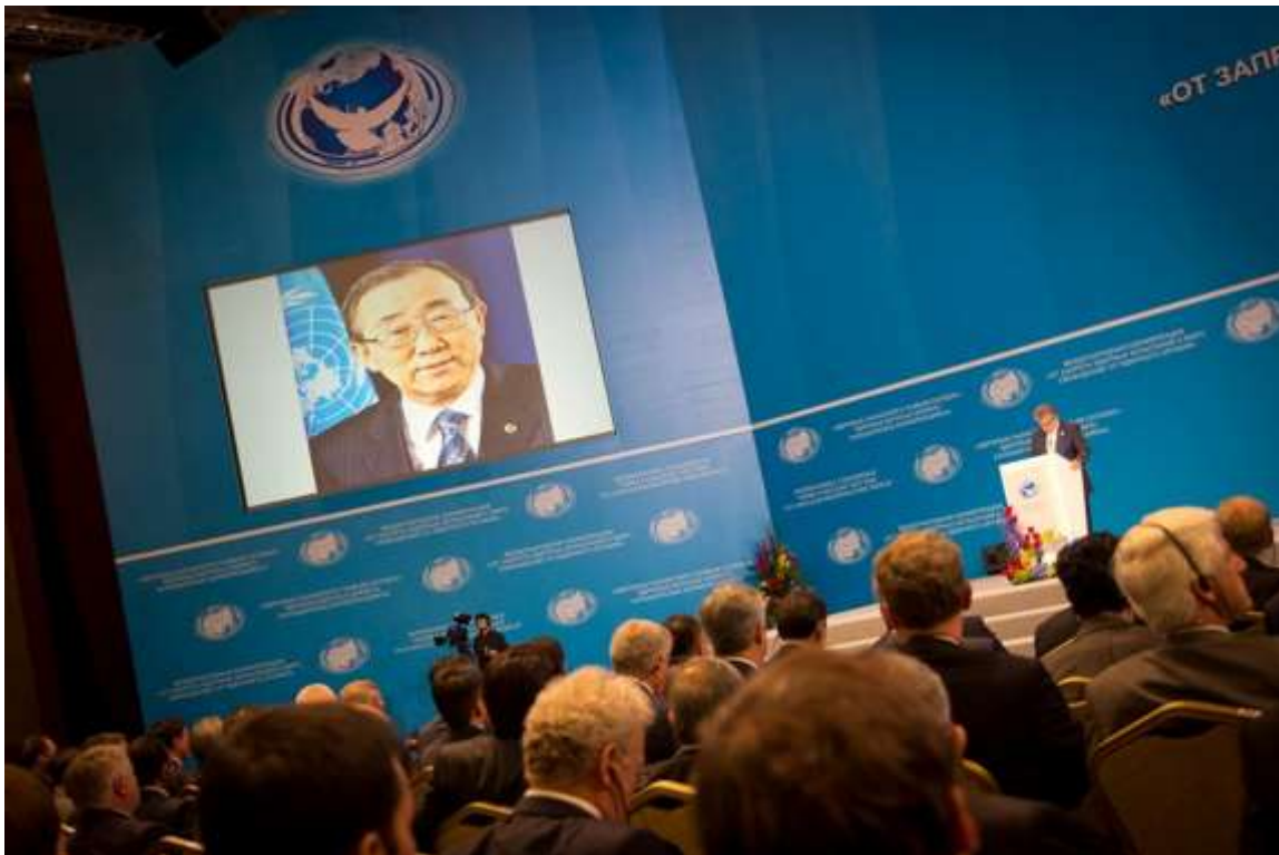
UN Secretary-General Ban Ki-moon's message being delivered to the PNND Assembly in Astana