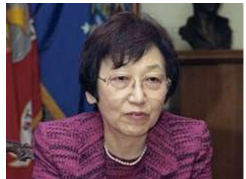
Yoriko Kawaguchi, PNND member, former Foreign Minister of Japan and an endorser of the Joint Statement by Parliamentarians of Japan and the Republic of Korea supporting a NE Asia NWFZ

In December 2012, PNND and the Nagasaki Research Center for Nuclear Weapons Abolition organised conferences and public meetings in Nagasaki and Tokyo