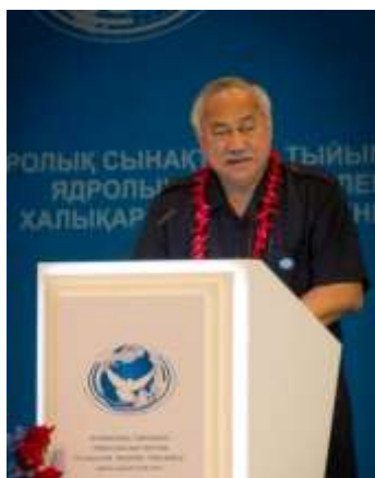
Eni Fa'aua'a Faleomavaega, Member of the US Congress from Samoa, speaks at the PNND Assembly about the impact of nuclear tests in the Pacific.

In August 2012, PNND held its annual assembly for the first time in a developing country – Kazakhstan. Support from Norway and from the Kazakhstan Parliament, which co-hosted the event, enabled PNND to bring a larger number of parliamentarians from developing countries to the assembly than had participated in previous assemblies. In total, nearly 100 parliamentarians from 80 countries participated, including 45 from developing countries (including Afghanistan, Azerbaijan, Bangladesh, Costa Rica, Ecuador, Egypt, Ghana, India, Indonesia, Iraq, Jordan, Kazakhstan, Kyrgyzstan, Lebanon, Pakistan, Philippines, Saudi Arabia, South Africa, Thailand, Turkmenistan, Uruguay and Uzbekistan).