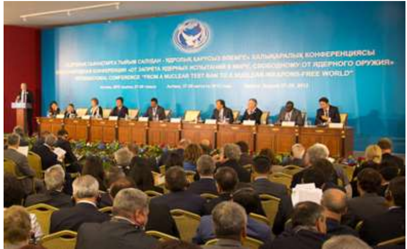
PNND conference in Astana, Kazakhstan

PNND, the only global network of parliamentarians focusing on nuclear non-proliferation and disarmament, is a key player in facilitating the implementation of key disarmament commitments, in building the political momentum required for the achievement of additional agreements, and in advancing the norms and framework for a nuclear-weapons-free world.