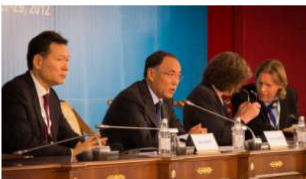
Kanat Saudabayev and Alyn Ware co-chair the final plenary of the PNND Assembly which adopts the Parliamentarians Declaration on Nuclear Abolition