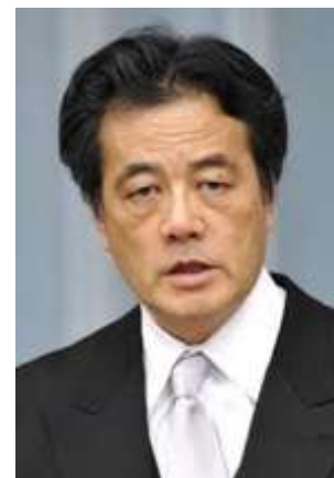
PNND Member Katsuya Okada (former Foreign Minister of Japan), key advocate for a NE Asian NWFZ and a member of the Asia Pacific Leadership Network

In addition, PNND has established formal and informal partnerships with a number of international organisations and networks through which PNND extends and expands its outreach, engagement and influence. These include Abolition 2000, Asia-Pacific Leadership Network for Nuclear Non-proliferation and Disarmament, European Leadership Network for Nuclear Non-proliferation and Disarmament, Global Zero, Inter Parliamentary Union, Middle Powers Initiative, Parliamentarians for Conflict Prevention, Parliamentary Forum on Small Arms and Light Weapons, Peace Boat and Religions for Peace.