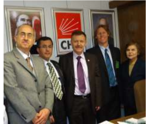
Aytug Atici MP (PNND Council Member Turkey) meets with Alyn Ware and Turkey IPPNW in the Turkish Parliament to discuss the Middle East NWFZ proposal